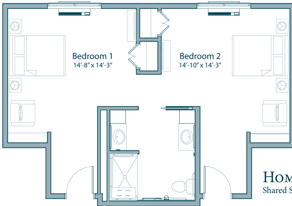
HOMESTEAD Shared Suite, 590 Square Feet